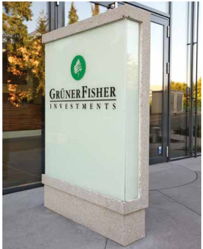
67688 Rodenbach, Germany