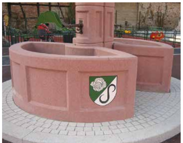
(68) Riedwihr, France – Fountain