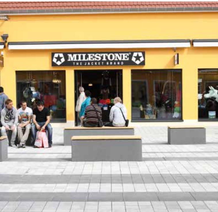
(67) Roppenheim, France - "The Style Outlets"