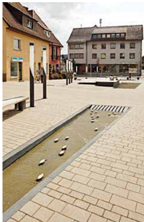
73730 Esslingen-Zell, Germany