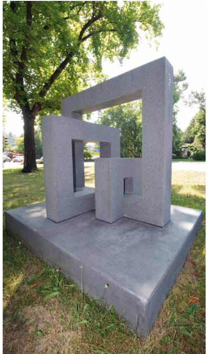
76530 Baden-Baden, Germany - Memorial Friederich-Ebert