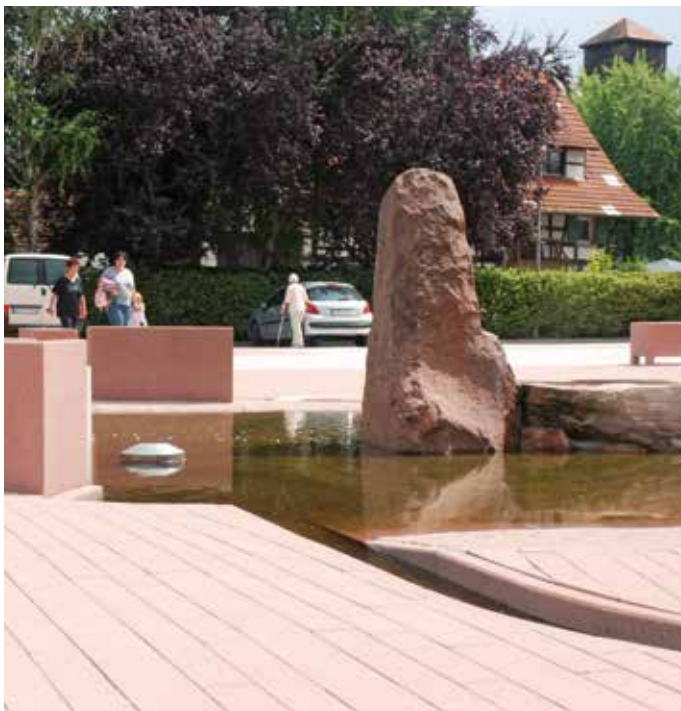
77797 Ohlsbach, Germany – Boerscher Platz

Water brings life and energy: Kronimus products call for architectural choreography, a trickle of water, fountains, jets, or water features, etc. Together with specialists and atmosphere creators, Kronimus provides its know-how to create a cooling effect and bring movement to space.