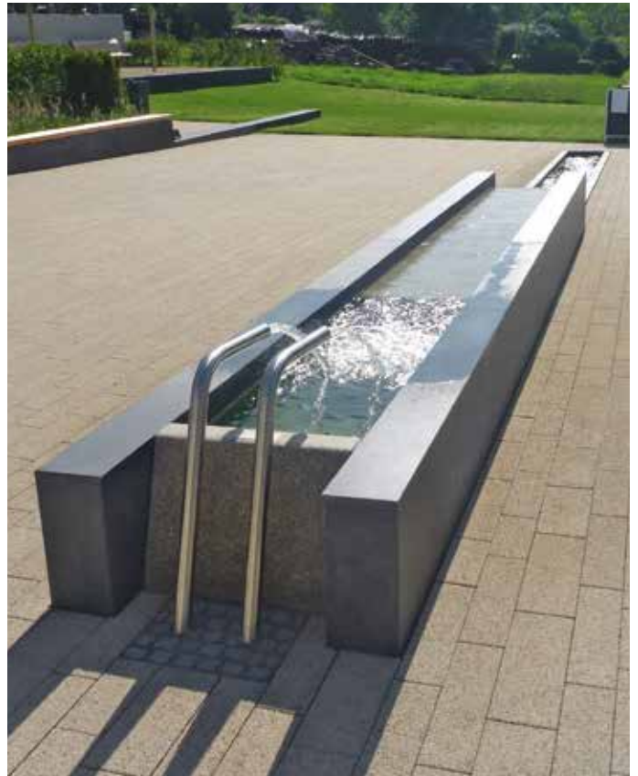
73760 Ostfildern-Scharnhausen, Germany - Riefernplatz