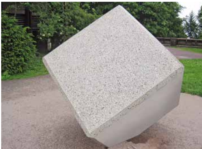
76530 Baden-Baden, Germany - „Merkur“