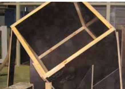
76530 Baden-Baden, Germany Working drawings and wooden mould for the "Merkur Cube"