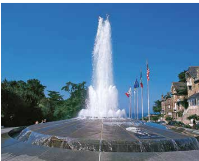
(35) Dinard, France – Jules Verne fountain, diameter 18 m