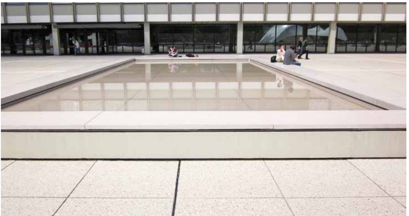
71634 Ludwigsburg, Germany - Pädagogische Hochschule