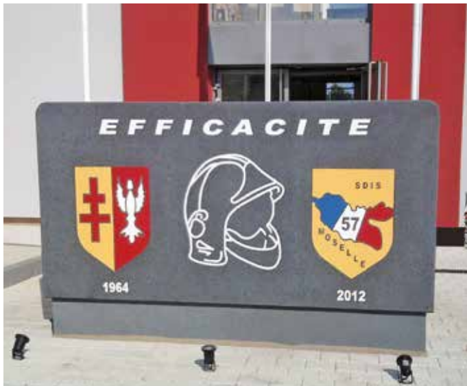
57200 Sarreguemines, France - Fire Station

It is not only about providing the concrete for a customized piece, but taking it as far as the product finish. Inlaying a logo, a coat of arms or a free text: from design to delivery, all the steps are in good hands with Kronimus.