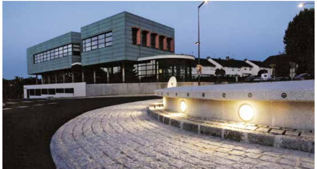
(56) Lorient, France - Roundabout

Light technicians take advantage of these technical exploits to elegantly fit their lighting features, in complete safety. The results are impressive, particularly when water and light are combined.