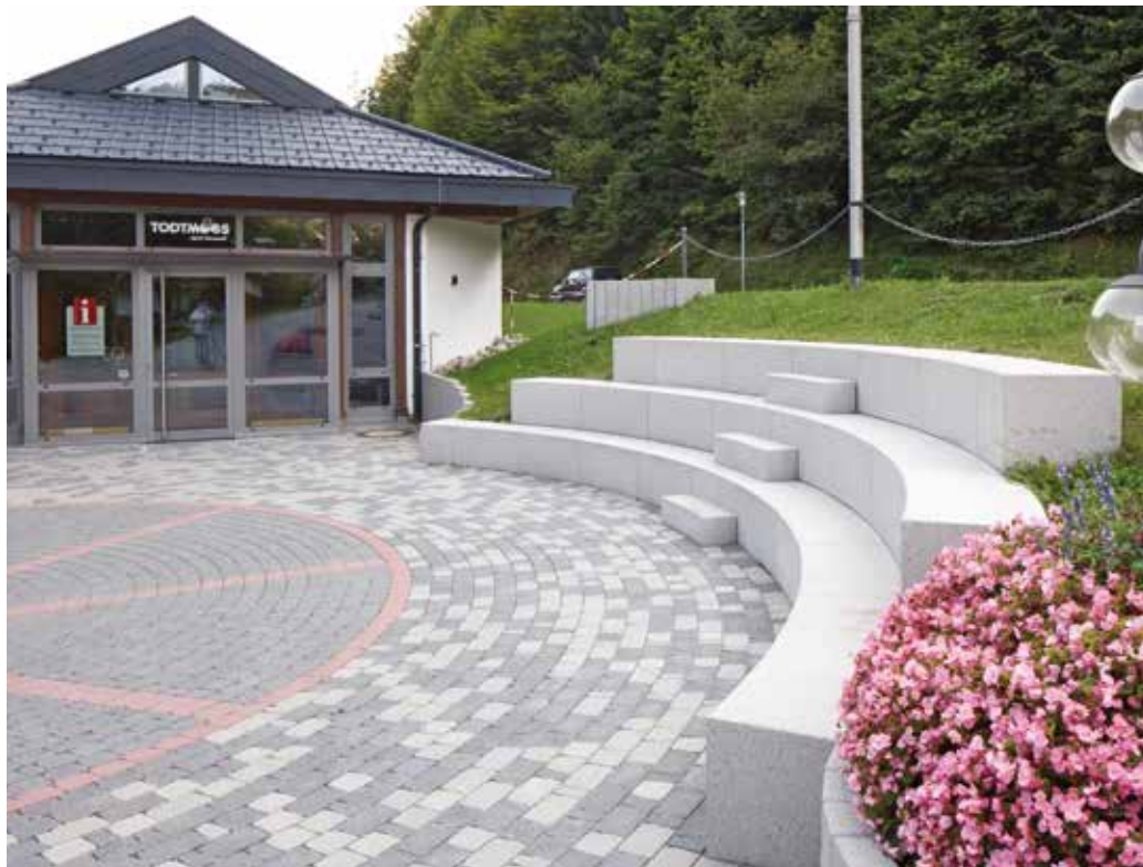
79682 Todtmoos, Germany - tiered stairs

In addition, water or light features can be included. For stairways with specific loads, static load studies are carried out by specialized design offices.