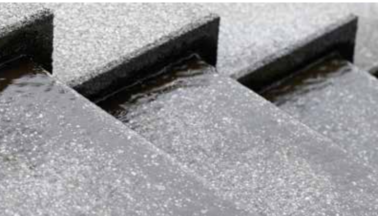
54516 Wittlich, Germany - watercourse

between the various concrete elements must be filled to ensure longevity. Kronimus's experience in the field is invaluable and is based on fine projects already produced.