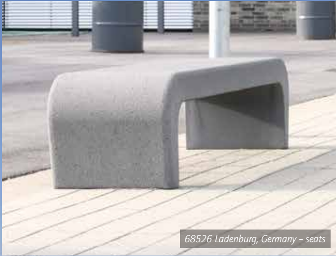
68526 Ladenburg, Germany - seats