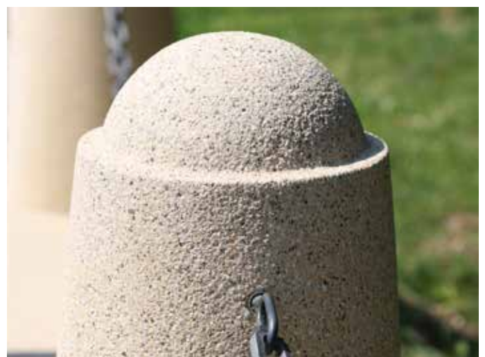
67158 Ellerstadt, Germany

This wide catalogue of solutions offers a panel of affordable prices for all budgets, particularly since certain models are included in the standard street furniture manufacturing programme.