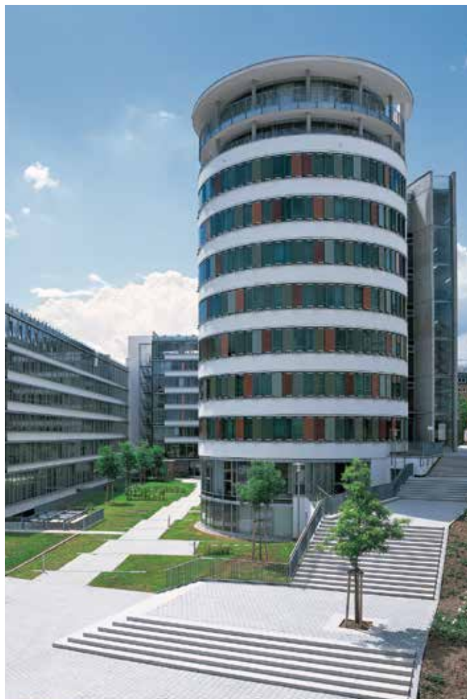
76135 Karlsruhe, Germany - PSD-Bank