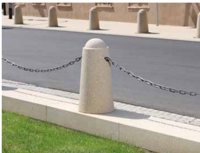
67158 Ellerstadt, Germany

With 40 years of experience, Kronimus occupies a special place in the manufacture of exceptional pieces. Perfect creations matching the customized requirements of designers: after defining formats, colours and surface coatings, our workshops transform these demands into bespoke finished products. Exclusive fountains, sculptures and distinctive street furniture leave our workshops with a quality craftsman's finish.