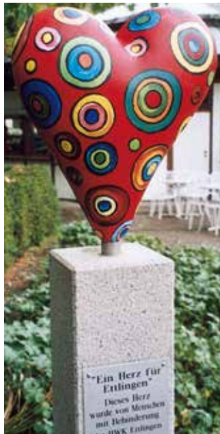
76275 Ettlingen, Germany - housing estate garden