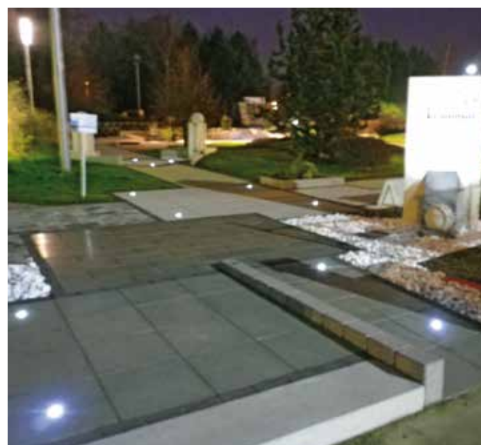
(57) Maizières, France - Kronimus's Garden