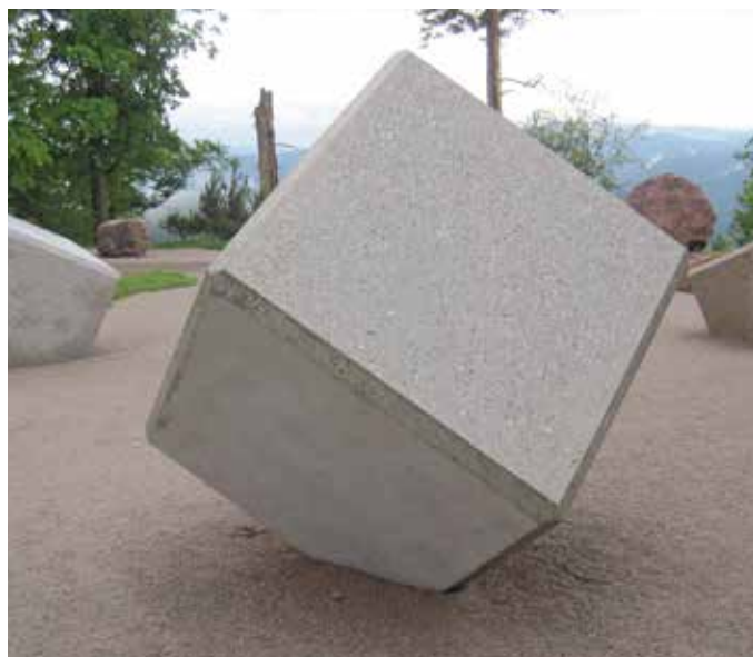
Photo opposite: Making of the "Merkur Cube", an artistic exhibition of concrete elements at the tip of Merkur Mountain in Baden-Baden (Germany).