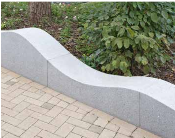
65201 Wiesbaden, Germany - Laufmauer