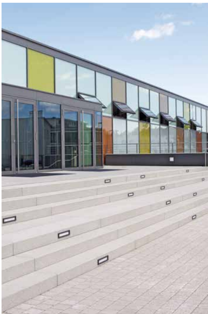
77118 Bühl, Germany - sports centre