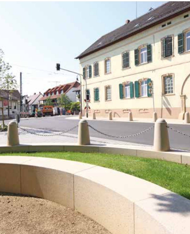
67158 Ellerstadt, Germany