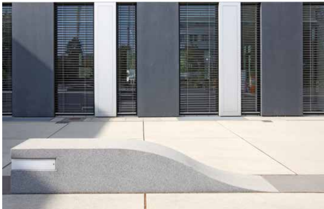
Winner of the Sarre Design Award. Sinusoidal bench - Science Park, 66123 Saarbrücken, Germany

When it comes to benches, seats and other seating solutions, urban street furniture excels in ingenuity. Beyond the many current well-known shapes, the combination of materials represents an endless source of ideas for the urban planner keen on construction features. Kronimus will integrate additional elements such as metal, resins or wood (Coelan varnishing for European woods) on request.