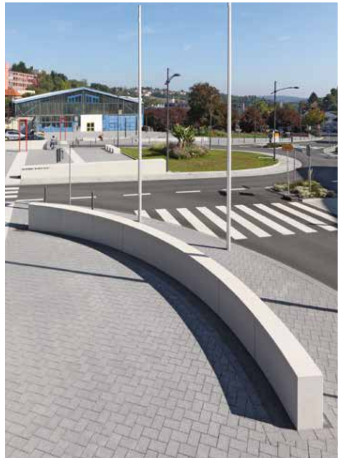
66953 Pirmasens, Germany – Messe

Providing structure and safety, and delimiting: customized pieces do not only add to architectural space, but they are often installed with a functional purpose. The range of sizes is very broad: from the large block of stone of X length to the small boundary stone.